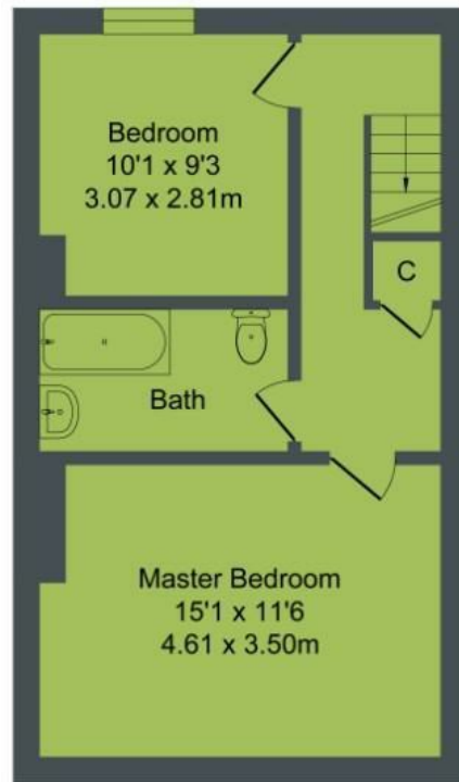
First Floor Approx. Floor Area 409 Sq.Ft (38.0 Sq.M.)